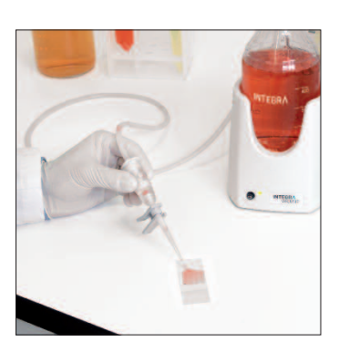
Removal of excess liquid from object slides