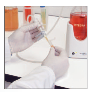
Aspiration of supernatants