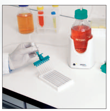
Aspiration from Western blot strips