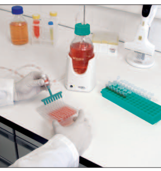
Removal of washing solutions