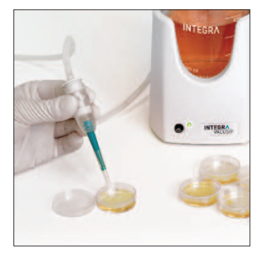
Removal of culture media