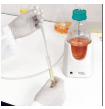
Supernatant removal to harvest bacteria