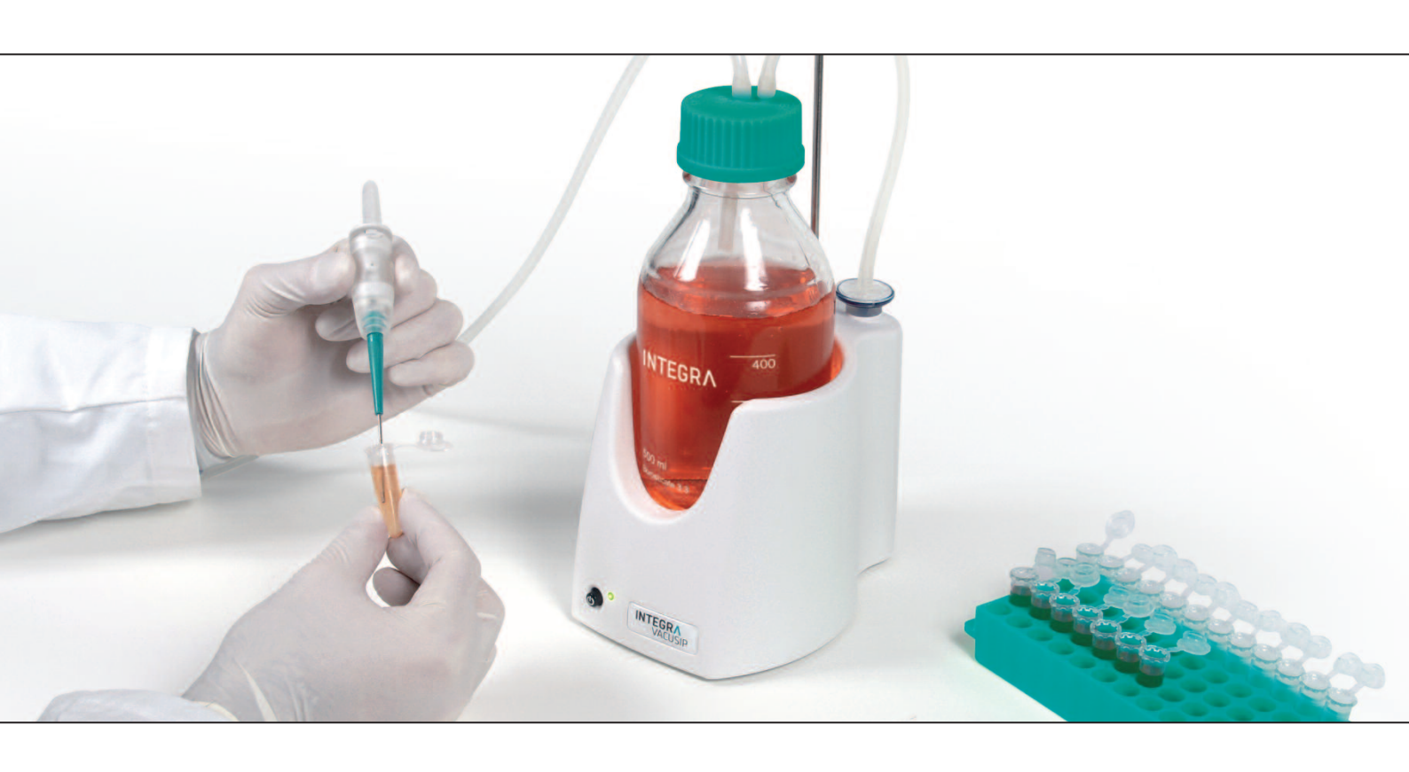
VACUSIP Liquid waste gone in a sip