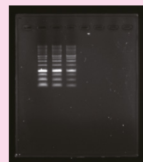
Exposure: 0.440 Aperture value : f/2.8