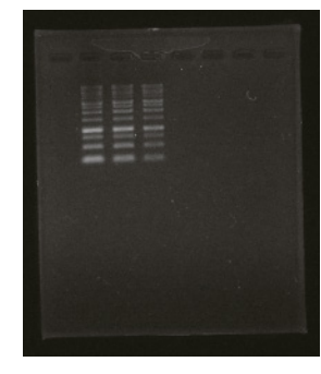
EC: -1.3EV Aperture value: f/2.3 SS: 1/15 seconds ISO:AUTO (-3200)