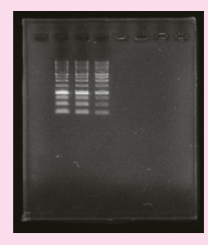
EC: -0.7EV Aperture value: f/2.3 SS: 1/60 seconds ISO:AUTO (-3200)