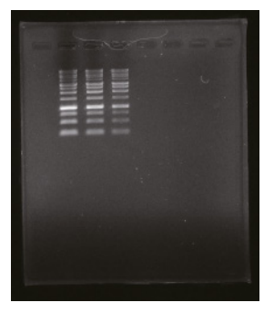
EC: -2.0EV Aperture value: f/2.3 SS: 1/80 seconds ISO:AUTO (-2000)