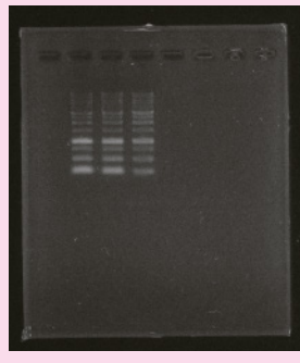
EC: -0.7EV Aperture value: f/2.3 SS: 1/10 seconds ISO:AUTO (-3200)