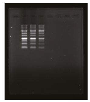
Exposure: 0.200 Aperture value: f/2.8